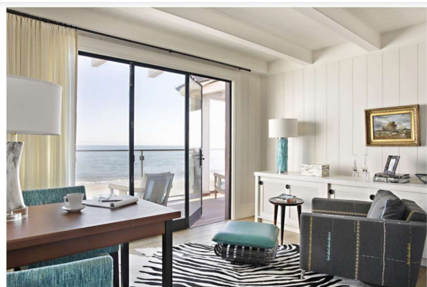
The master bedroom looks out to amazing sea views

Other decorative elements, such as the tasselled and richly embroidered accent cushions in a plethora of colours, and the ornate wall shelves and lanterns, add visual richness and a lively feel.