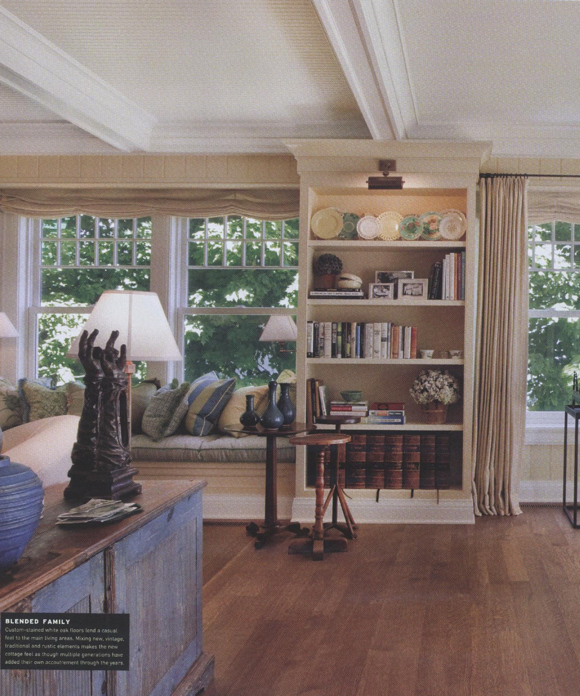
BLENDED FAMILY Custom-stained white oak floors lend a casual feel to the main living areas. Mixing new, vintage, traditional and rustic elements makes the new cottage feel as though multiple generations have added their own accoutrement through the years.