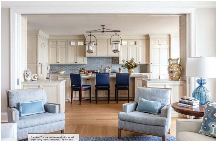
From top: The new addition resulted in a much larger family room and kitchen. The blue hues include a pair of chairs covered in Holland & Sherry fabric, counter stools from John Russell and a ceramic tile backsplash from Fine Line Tile. Stone flooring and white wall tile complement the blue wallcovering in the master bathroom.