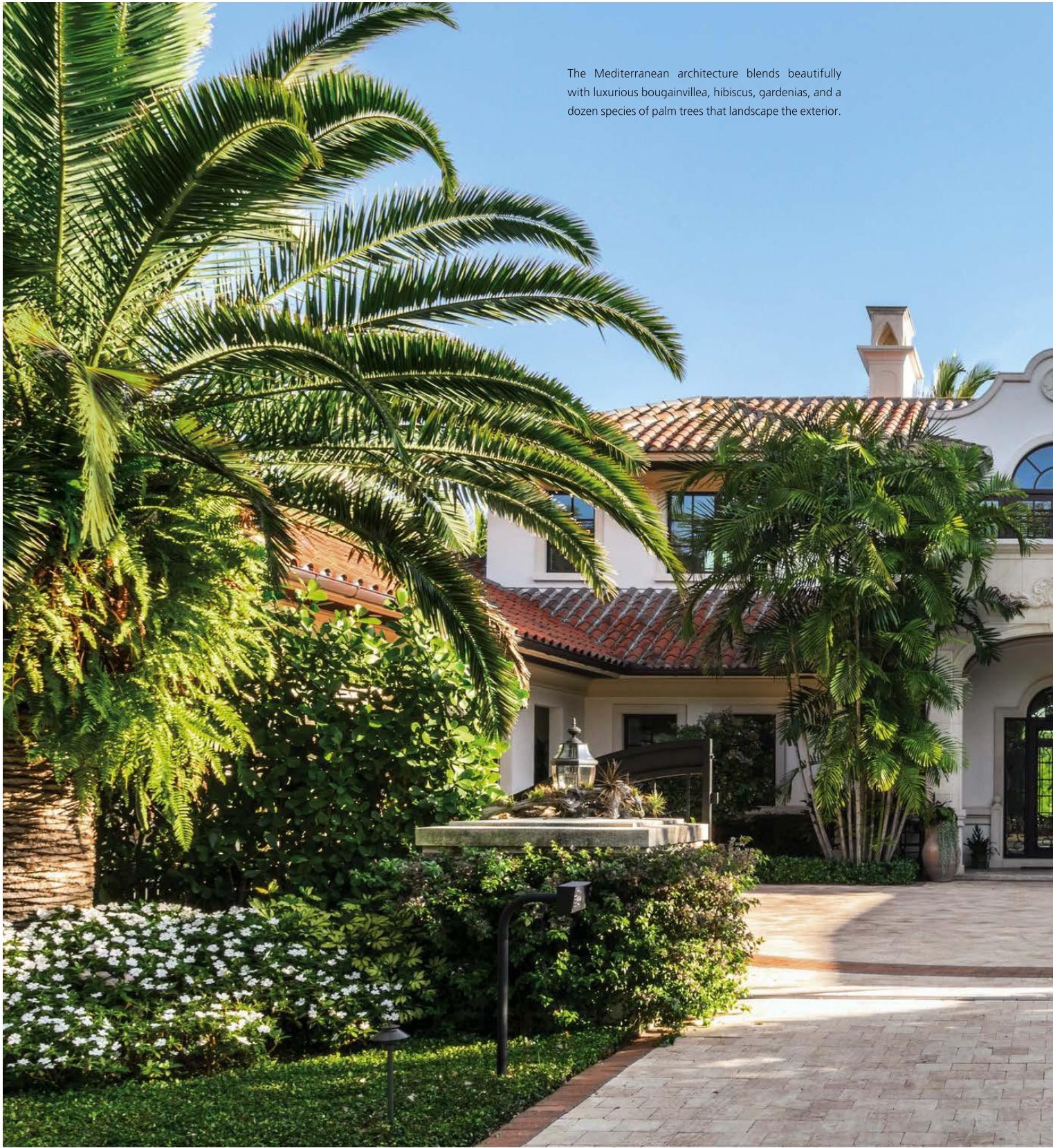
The Mediterranean architecture blends beautifully with luxurious bougainvillea, hibiscus, gardenias, and a dozen species of palm trees that landscape the exterior.