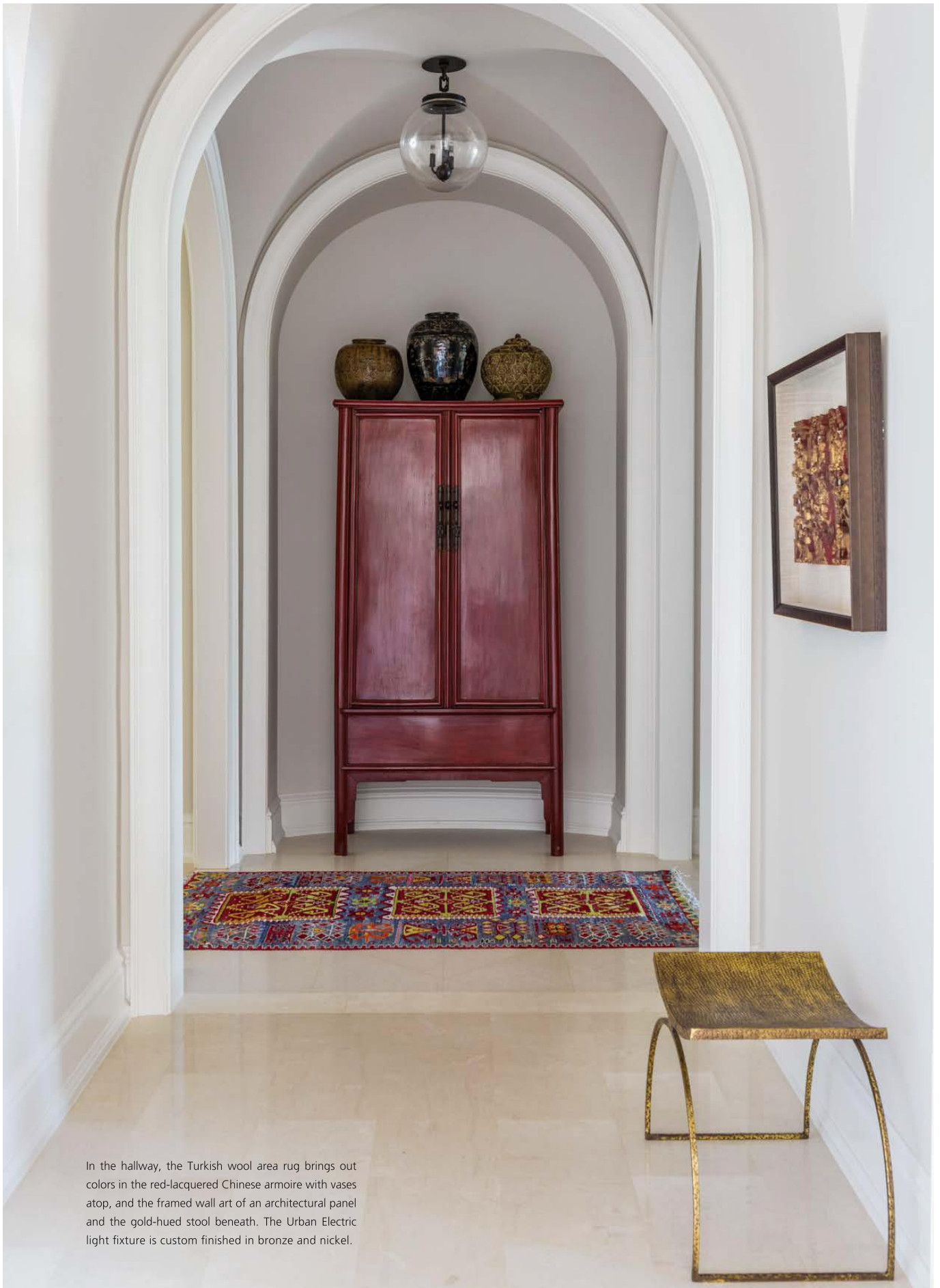
In the hallway, the Turkish wool area rug brings out colors in the red-lacquered Chinese armoire with vases atop, and the framed wall art of an architectural panel and the gold-hued stool beneath. The Urban Electric light fixture is custom finished in bronze and nickel.