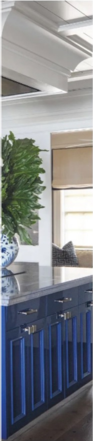
From left: Urban Electric & Co. pendants take their blue cues from the vibrant island in the kitchen, painted in a high-gloss indigo from Sherwin-Williams; the den features an Avery Boardman sofa, Bunny Williams stools from Lee Jofa topped with Edelman leather, a rattan chair by McGuire and an accent table from Bolier. Kerry Joyce window treatments contrast Thibaut's Adriatic grass cloth.